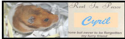
RODENT OR RABBIT PLAQUE WITH PHOTO £25 (SMALLER PLAQUE)