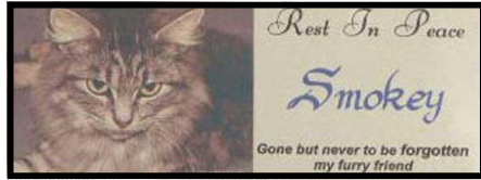
CAT PLAQUE WITH PHOTO £35