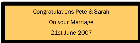
GENERAL PLAQUE WITH PHOTO £35